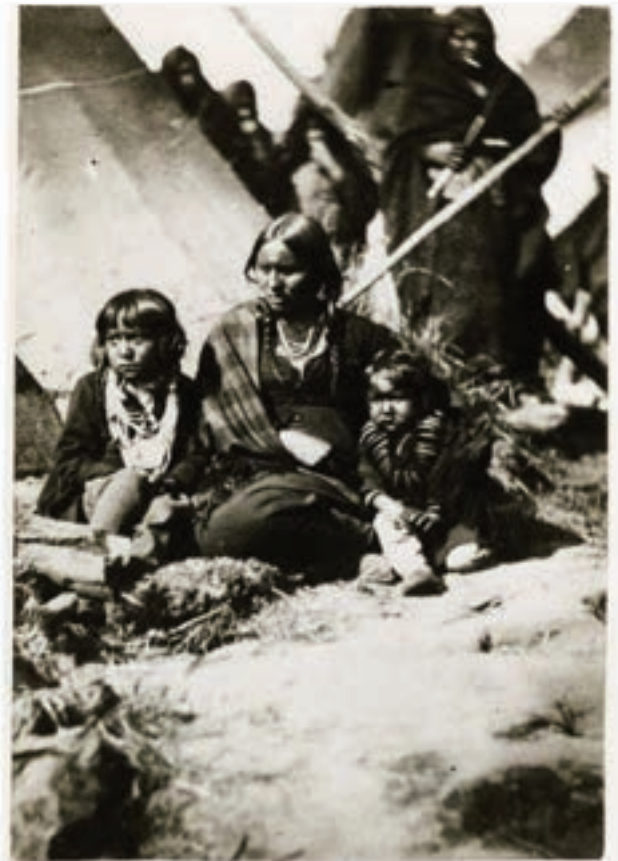
SIoux PRISONERS. (Wife and Children of Condemned Sioux Chief.) From Martin's Gallery of Indian Portraits, St. Paul.