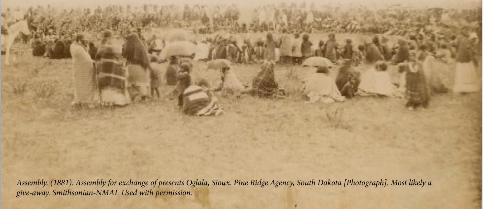
Assembly. (1881). Assembly for exchange of presents Oglala, Sioux. Pine Ridge Agency, South Dakota [Photograph]. Most likely a give-away.