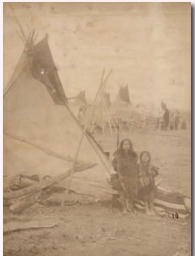
right: Two youngsters outside tipi (Note long otter breastplate on boy (r.) and (trade) Navajo blanket on ground, Pine Ridge Agency