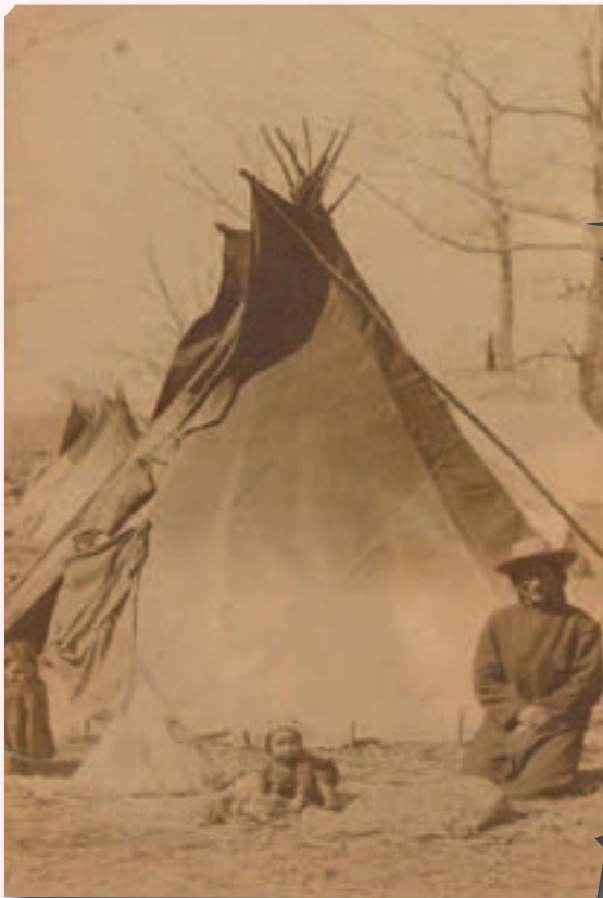
left: Infant is playing. (n.d.). Infant is playing with toy in front of tipi. Fort Sully, Cheyenne River Reservation, S.D. ca. 1870. [Photograph]. Smithsonian-NMAI. Used with permission.