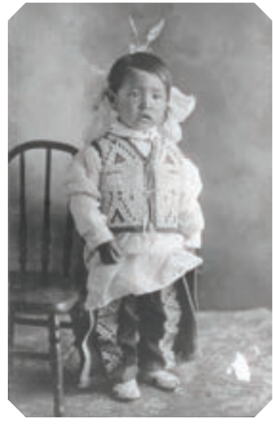
Child in traditional clothing. (1922).

Oceti Sakowin origin, thought and philosophy continues to be vibrant, strong and taught to the younger generation today.