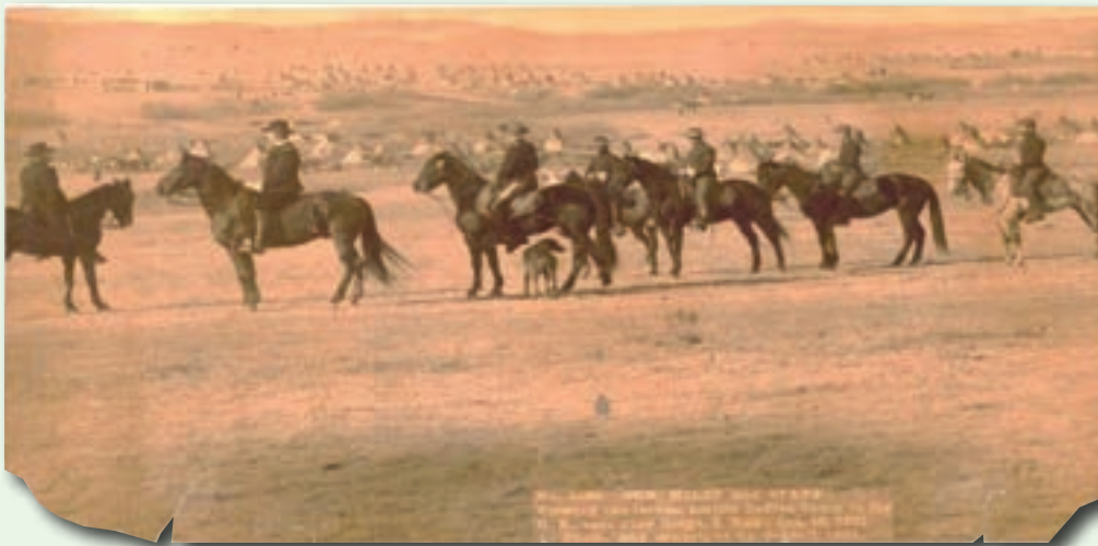
Albumen print of soldiers on horseback looking at numerous tipis in distance, entitled “Gen. Miles and staff are viewing the largest hostile Indian camp in the U.S. near Pine Ridge, S.D.”

Currently, historical perspective, oral tradition and written accounts about the Oceti Sakowin are being revisited and examined for accuracy, validation, and inclusiveness. The Oceti Sakowin people have long integrated literacy into their culture, and yet did not sacrifice their high regard for their historical oral tradition.