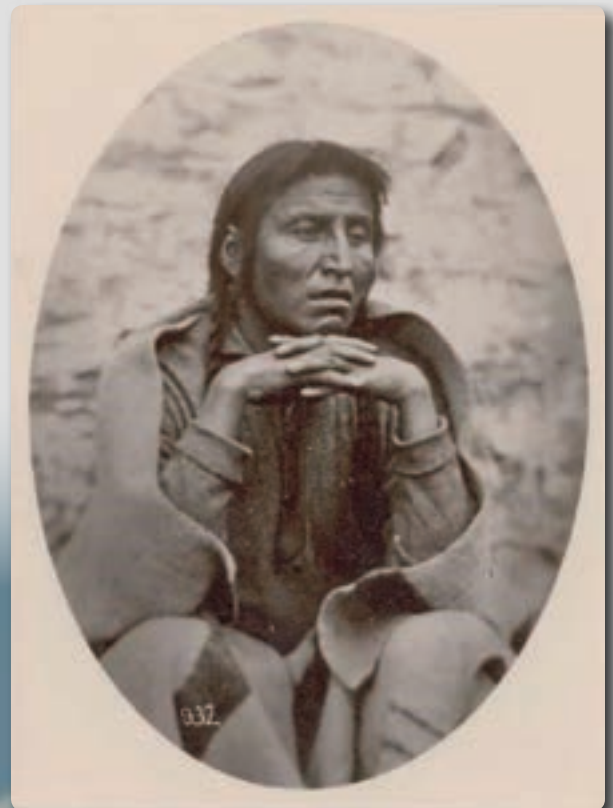
Portrait of the man Wa-kan-o-zan-zan or Medicine Bottle, excuted at Ft. Snelling 11/11/1865 for the 1862 Sioux Uprising [Photograph].