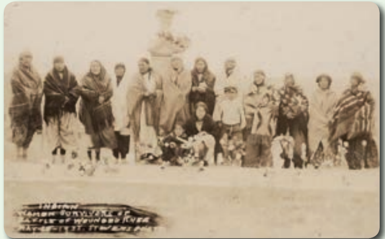
Women Survivors of Wounded Knee at cemetery, May 25, 1932. View of a group of female survivors of the Wounded Knee Massacre, posed in front of the monument at the Wounded Knee cemetery honoring the dead of the Massacre on 29 December, 1890. They are posed with children, floral tributes, and American flags. The monument was erected in 1903 at the site of the mass grave of victims, by surviving relatives to honor the "many innocent women and children who knew no wrong..." who were killed in the massacre