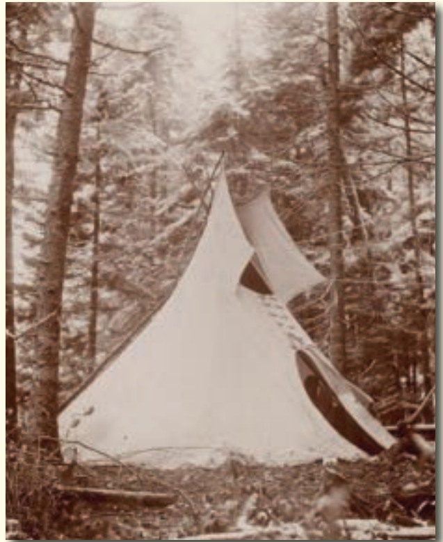
Tipi. (1884). Brule Sioux (Sicangu Lakota) Rosebud Reservation, South Dakota at the bequest of De Cost Smith [Photograph]. Smithsonian-NMAI. Used with permission.

Free Translation: We are honoring all those relatives who have gone to protect our freedom. (Individual's Lakota name) I remember my friend. They have been all around the world. (E. Bullhead 2012)